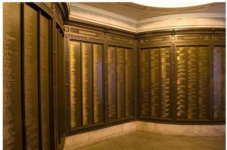
National War Memorial – Adelaide