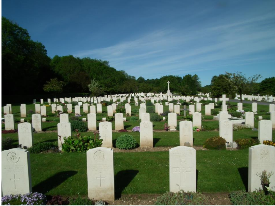
Tidworth Military Cemetery, Wiltshire