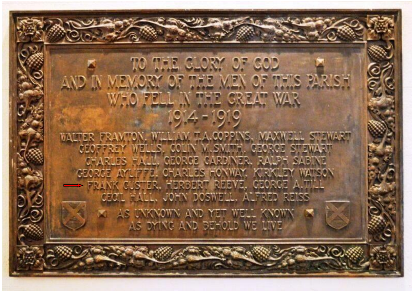
Walkerville Fallen Men of the Parish Plaque